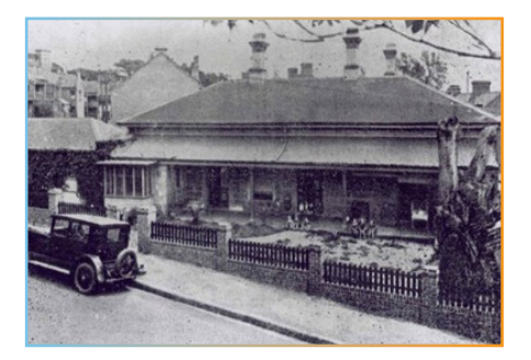
Above: 'Olive Bank', 1925 and right, the building in 2007.

home to grand residences on large estates, the Victoria Barracks and smaller artisans cottages.